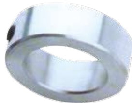
Zinc Plated finish. Stainless steel option: add suffix SS.